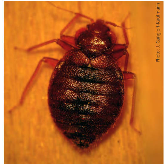
Adult bed bug.

Adult bed bugs are straw-colored to reddish-brown, oval bodied insects with undeveloped wings. Their upper bodies are covered with short, golden hairs. Before feeding, they're 1/4–3/8" long (about the size of a lentil) and nearly as flat as a piece of paper—which is why they can fit into such narrow crevices. Their appearance changes dramatically after they've fed; bed bugs become bloated and dark red and have been described as "walking blood drops." Their eggs are VISIBLE – white in color, bean-shaped and about 1/32" long, about the size of a grain of salt, with a "lid" at one end through which the young will emerge. Eggs are laid in crevices, scattered randomly or in small clusters.. Newly hatched bed bugs are light tan but otherwise resemble