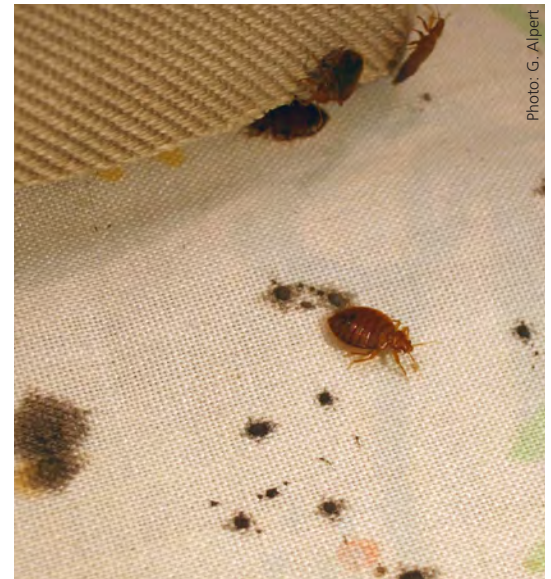
Adult bed bugs and fecal stains on fabric.