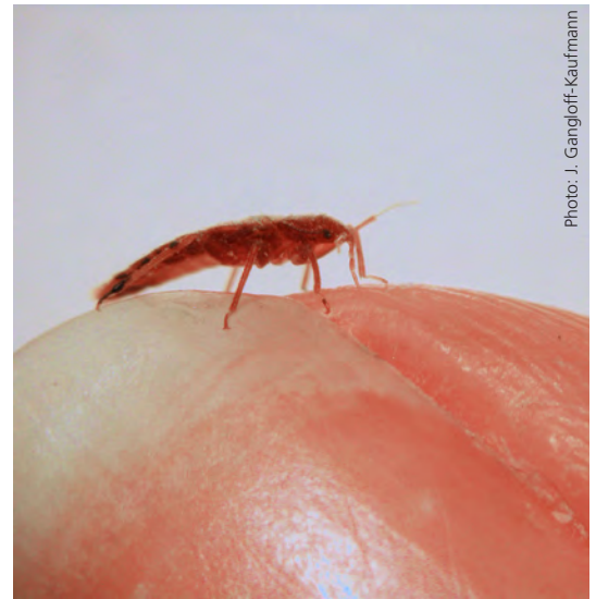
Hungry (and very flat) bed bug adult on a finger.

Fecal stains, composed of digested blood, may be the first sign of bed bug activity aside from live bugs or bites. They can be tan, brown or black in color and resemble magic marker stains on fabric. Look, also for the insects, their cast skins, and eggs near crevices. Check pillowcases, sheets, and the mattress for fecal stains. Examine the room thoroughly, moving in a pattern that radiates out from the sleeping or sitting area. Use an LED flashlight to peer behind and underneath furniture and woodwork. Look behind all items that are attached to or against the wall. It is also important to inspect new and used furniture before bringing it inside. Look in narrow spaces, along the seams, under folds of cloth, and under cushions.