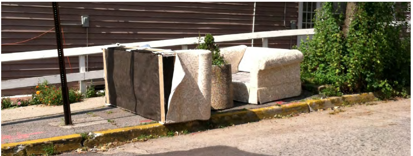
Discarded furniture, such as couches, is often infested with bed bugs.

It is possible to get a night of sleep, even if you have discovered bed bugs in your home. The key to comfort is being thorough. First, enclose your mattress and box spring in a bed bug-proof zippered encasement, which can be purchased at furniture or bed and bath stores. This gives you a clean, simple surface for sleeping and also seals in any bed bugs that were on the mattress or box spring. They will not be able to escape or bite through the material. Wash down the bed frame with soapy water and a scrub brush. Keep your bed away from the wall. Wash and dry all linens, bed skirts and blankets and/or throw pillows and linens into a hot dryer for 30 minutes to rid them of bed bugs. Replace and make sure the linens, bed skirt, and blanket don’t touch the floor. This will make it harder for the bed bugs to crawl into your bed. They don’t fly or jump, so crawling is their only option. To prevent bed bugs from climbing the bed legs, use traps that capture bed bugs in a well or moat—there are several brands available. Keep sleeping clothes on the bed and your regular clothes away from the bed. Don’t cross-contaminate. This should provide some relief for sleeping while the bed bug issue is being resolved. When done thoroughly, these steps create a bed bug-free area for sleeping.