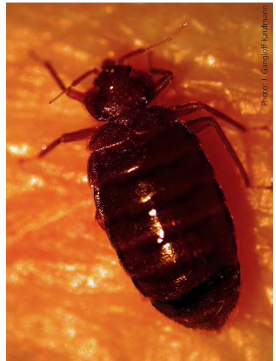
Well-fed bed bug engorged with blood.