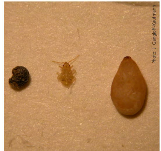
Newly hatched bed bug compared with a poppy and sesame seed.